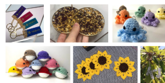
Some of the prizes