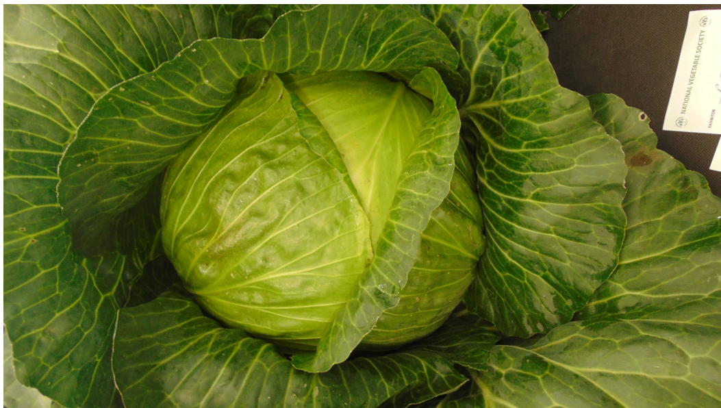
This cabbage is huge!