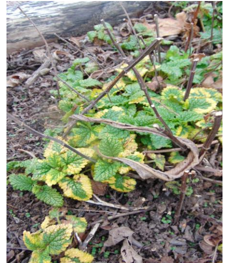
Rosemary, Lemon Balm and Variegated Lemon Balm.....