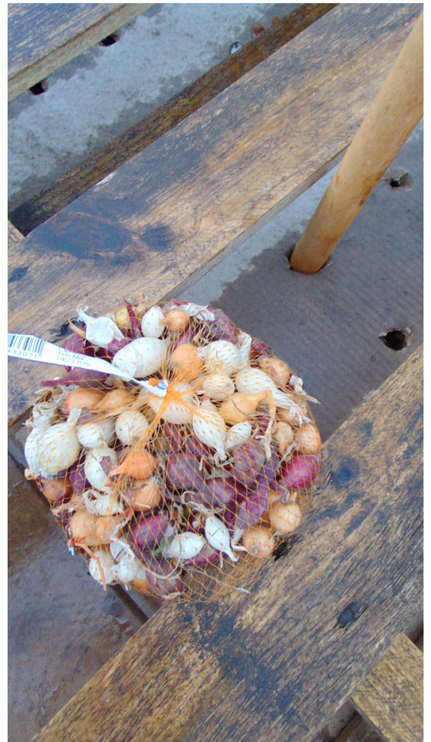
Tris of Onions