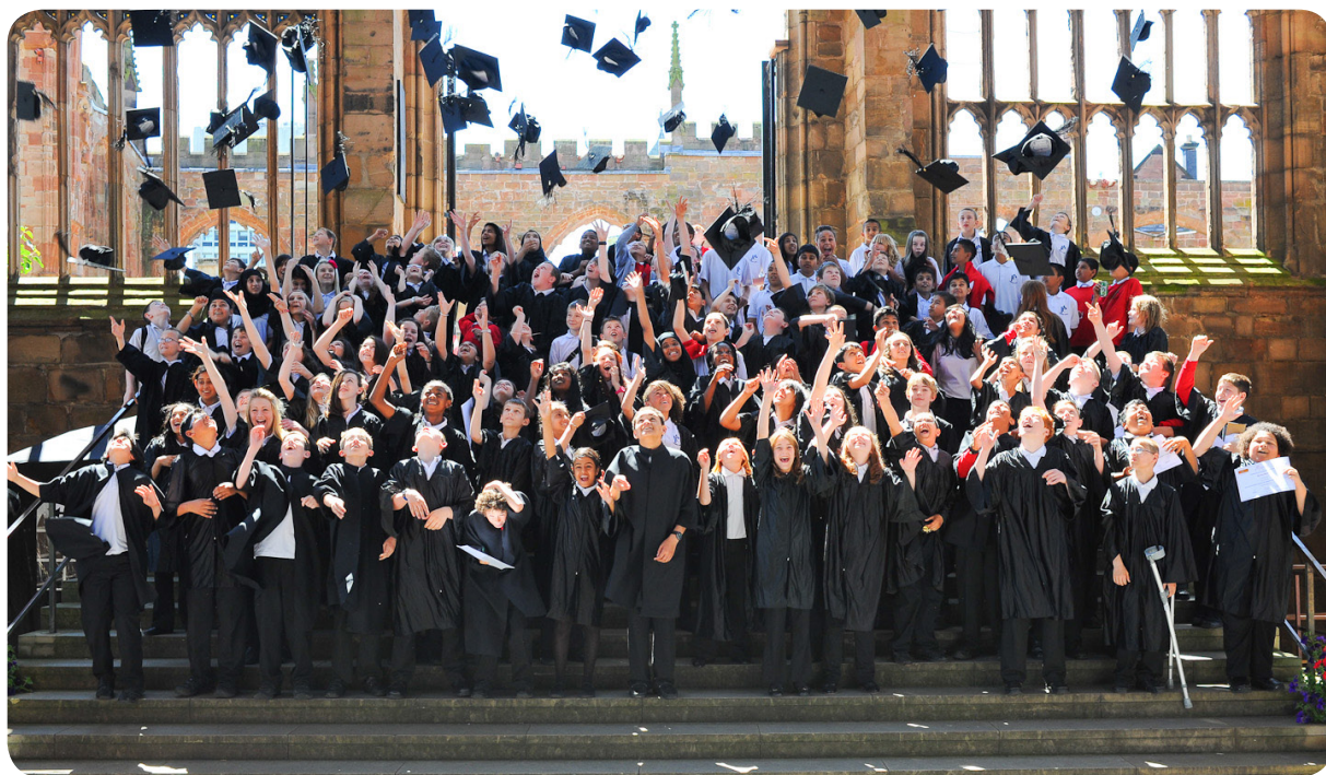
Year 7 students celebrating the best possible start to their secondary school education.