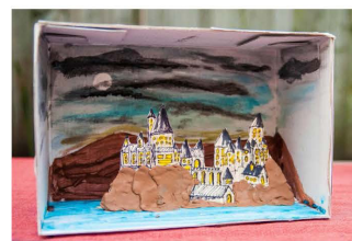
Harry Potter by J K Rowling

To enter the competition, please follow these instructions: