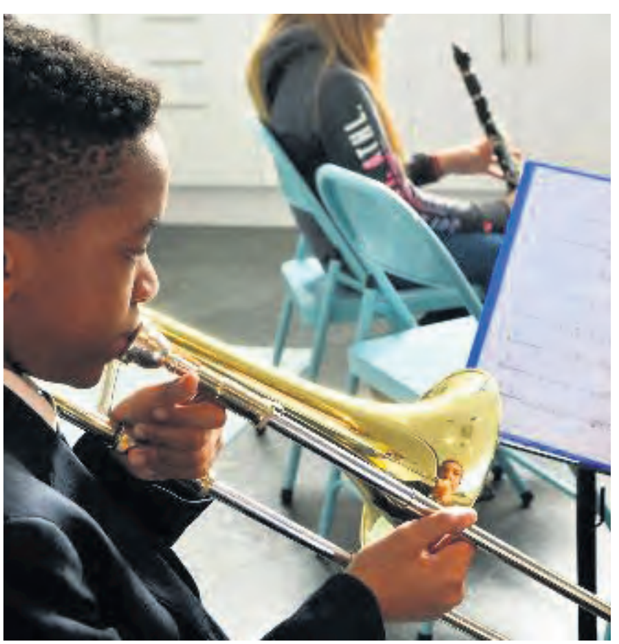
Deep concentration by a young musician

RESIDENT Kennedy School is consistent in believing in its core values – Students First, It's About Learning and No