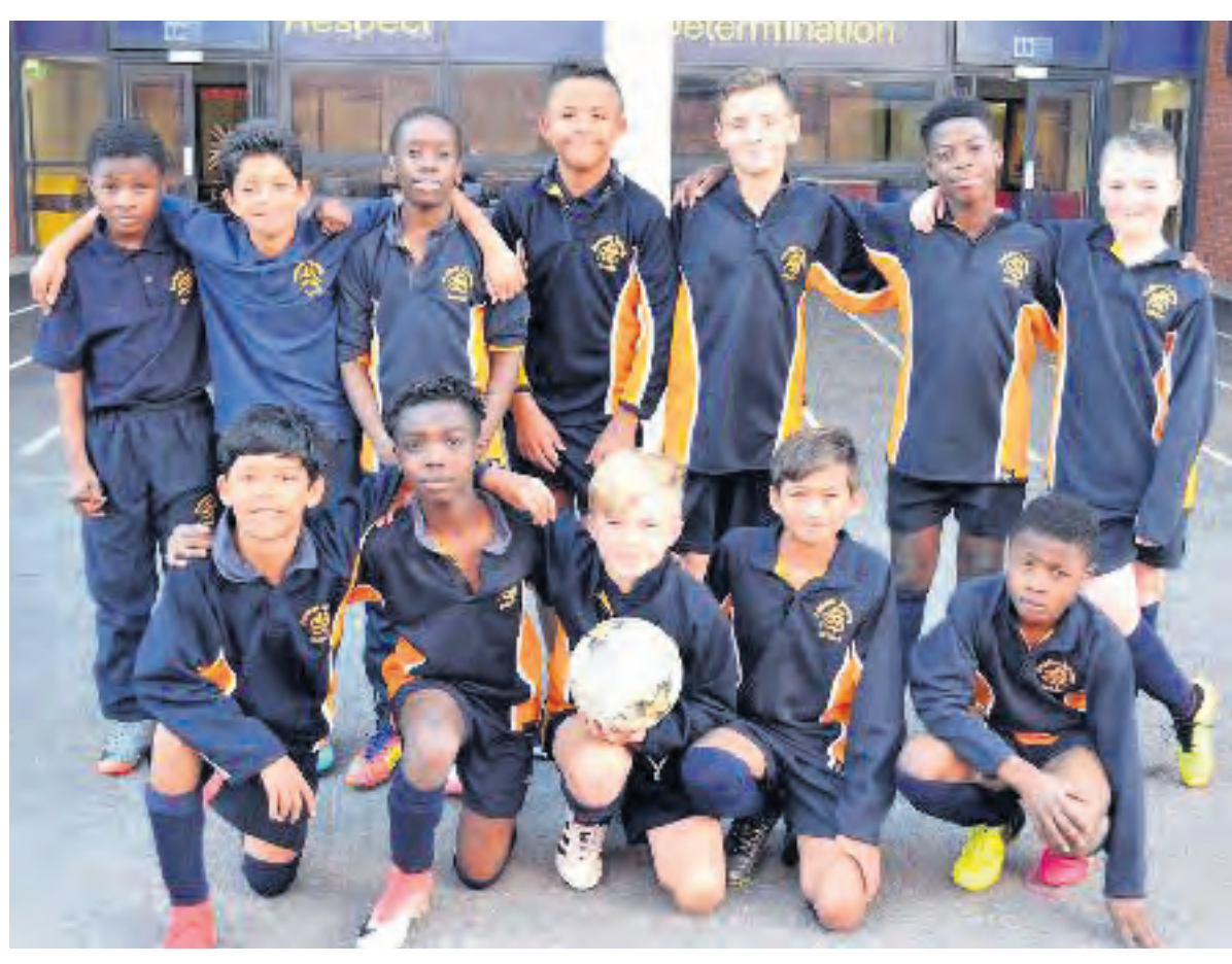
The Year 7 footballers have shone