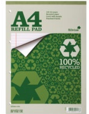
An A4 pad of lined paper