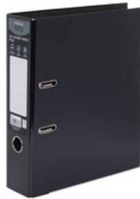
Lever arch files (one for each subject to stores notes at home)