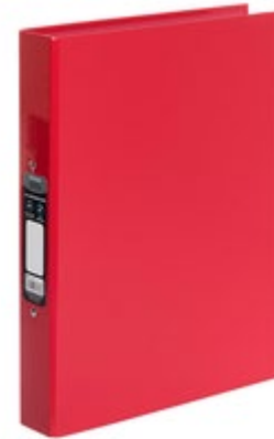
An A4 working file (for class notes and work for that week)