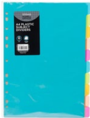
Subject dividers (one for each file)